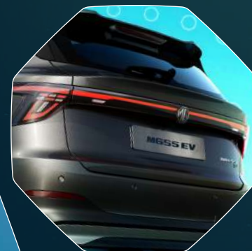
MG FAMILY ARCH TAILLIGHT