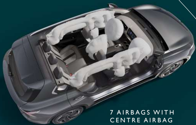
7 AIRBAGS WITH CENTRE AIRBAG

The MG55 EV doesn't just think fast, it thinks safe. Features like Autonomous Emergency Braking (AEB), Lane Keep Assist (LKA), Rear Cross Traffic Alert (RCTA), Drowsiness Monitor System (DMS), and Door Opening Warning (DOW) provide more safety and protection in tricky situations. Seven airbags, including a centre airbag, protect you from all angles. Finally, add a reinforced chassis and advanced braking, and you've got peace of mind.