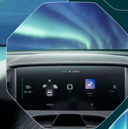
10.25" INSTRUMENT CLUSTER