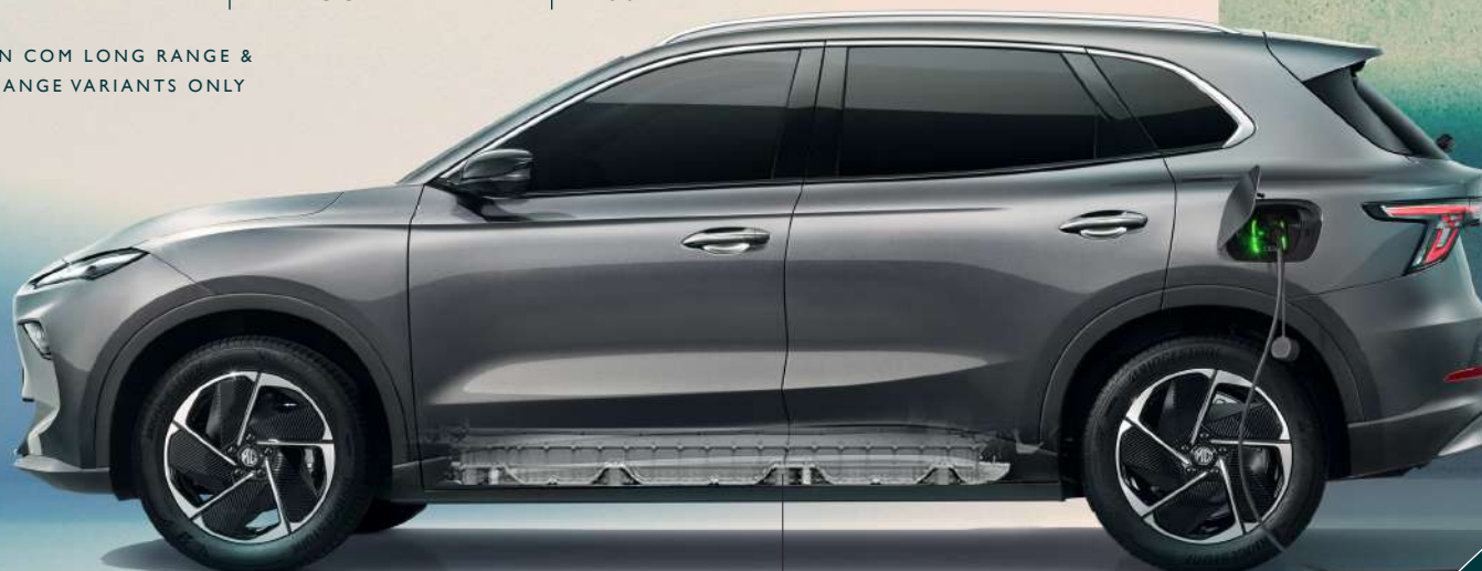
HORIZONTAL LAYOUT BATTERY WITH ULTRA-THIN DESIGN

*AVAILABLE IN COM LONG RANGE & LUX LONG RANGE VARIANTS ONLY