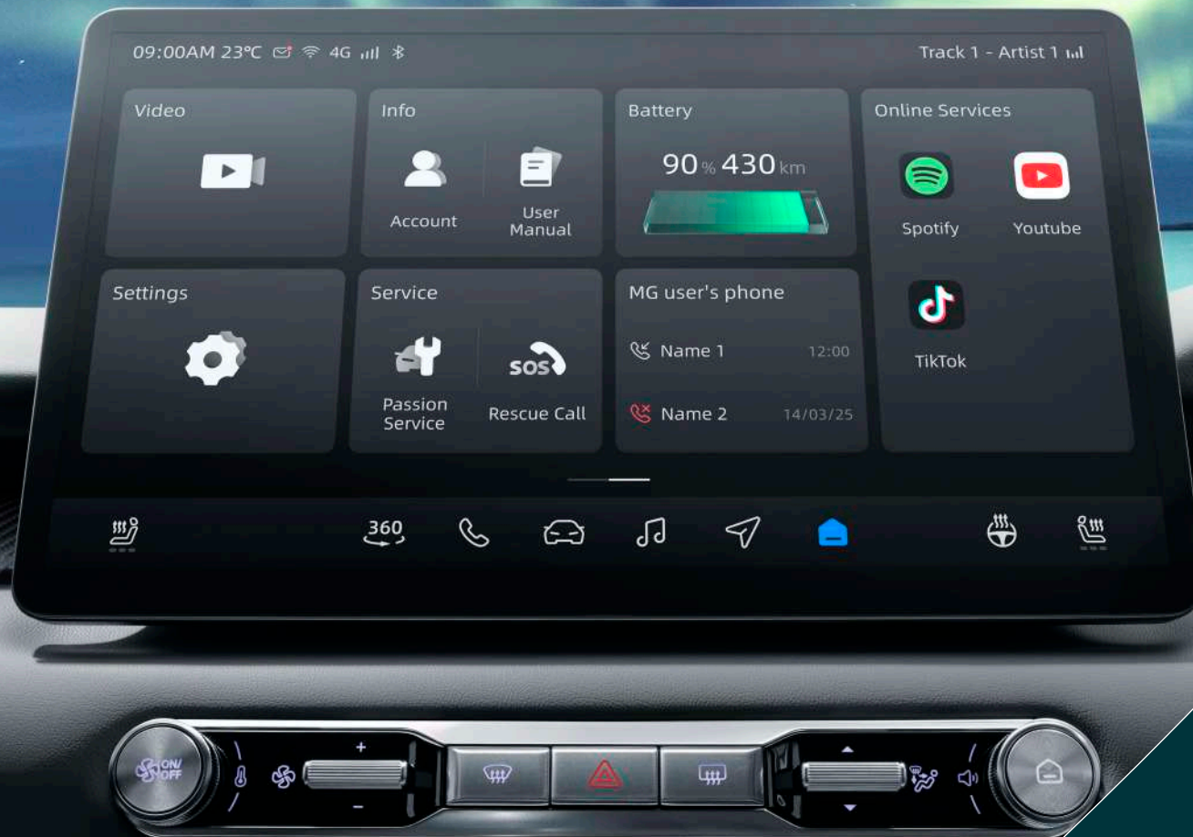
12.8" CENTRAL CONTROL SCREEN WITH ONLINE APP SERVICES*

The MGS5 EV puts control at your fingertips, literally. The 12.8" Central Control Screen and 10.25" Instrument Cluster give you everything you need at a glance, while MG iSMART keeps you effortlessly connected to your car - check your battery, find your car, lock and unlock it straight from your phone. Voice control makes it all hands-free, and with Vehicle-To-Load (V2L) tech delivering up to 6kW of power, your car becomes a power source on the go.