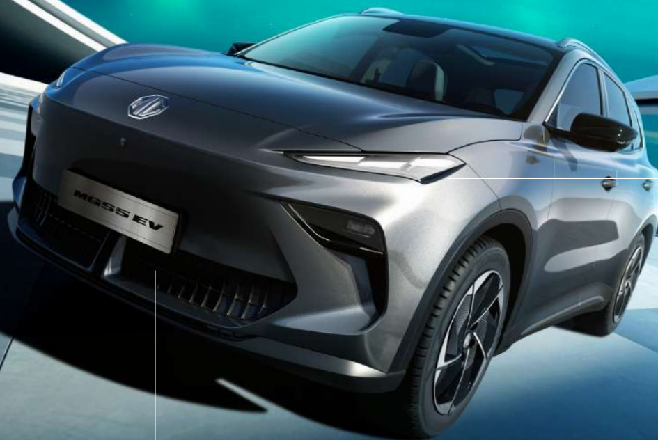
WIND HUNTER ACTIVE INTAKE GRILLE

The MGS5 EV's design speaks without saying a word. The Wind Hunter Active Intake Grille and Racing Flag Themed DRL Headlights create a bold first impression, while the sculpted bodywork and sporty stance reflect MG's heritage of performance. The MG Family Arch Taillight leaves a signature glow as you drive away, and 18" Alloy Wheels ground the design in style. The Panoramic Sunroof* opens up the cabin to the sky, making every drive feel that much more limitless. Timeless design, unmistakably MG.